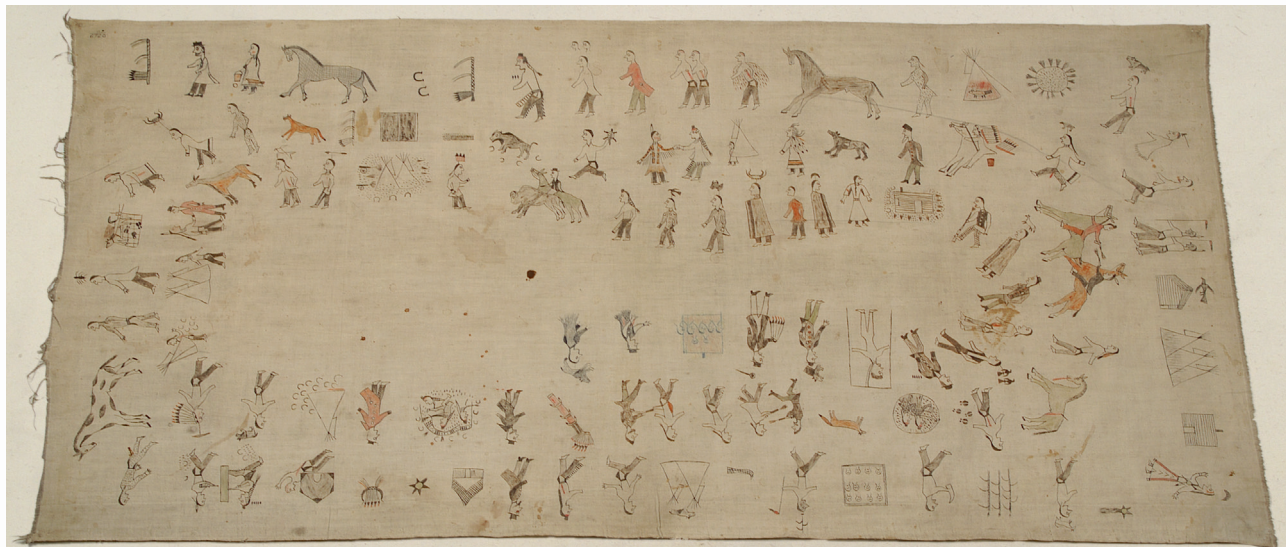
TRENDS in Cognitive Sciences

In considering the possible cognitive consequences of familiar contemporary temporal technologies, it is important to emphasize that, as ubiquitous as they now are, they emerged and spread only very recently in human history. The first timelines in the West seem to date only to the 1700s [88], and widespread literacy is largely a 20 th century historical development. Present day small-scale societies that rely on oral traditions, whose temporal technologies are either qualitatively different from Western post-industrial ones or in some cases altogether non-existent, may throw critical light on these issues.