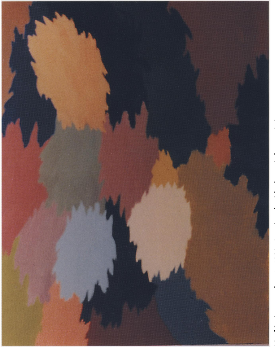
Neuf Series, number 4, 1990. Reprinted with the artist's permission.