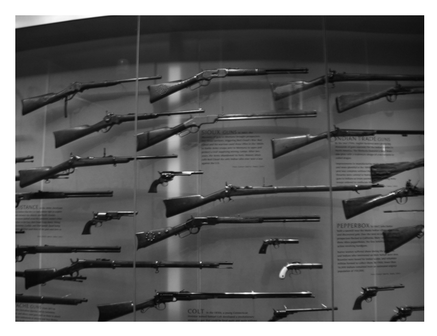
FIGURE 1. Guns display in the Our Peoples gallery.

all pointed in one direction, toward the display of gold in the adjacent panel. A portion of the text inside the gun case reads: