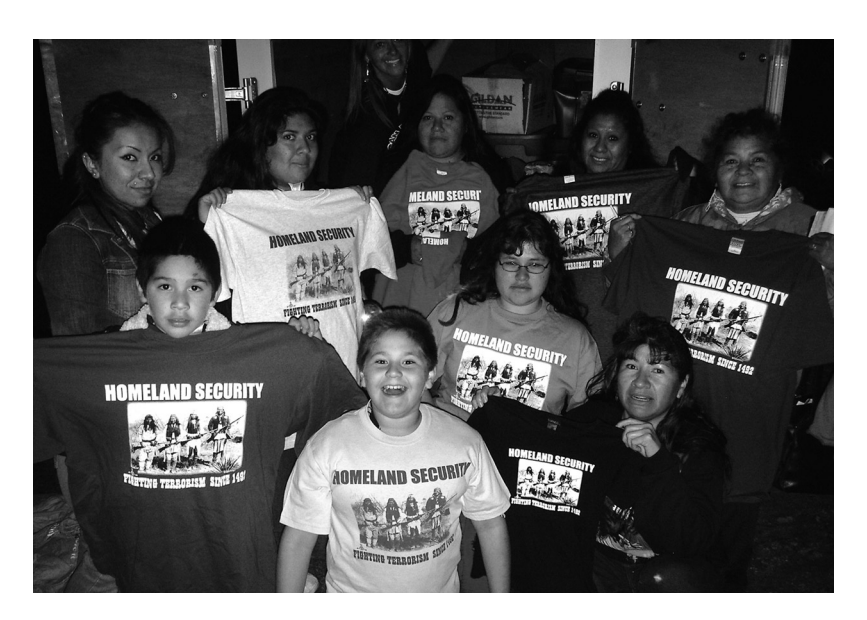
FIGURE 2. Showing t-shirts, "Homeland Security: Fighting Terrorism since 1492."

Why BIBLES? Christianity weaves a thread of shared experience that links Native People across the hemisphere. Wherever Europeans went, they spread the gospel. This wall features more than 100 bibles, translated into nearly 75 indigenous languages. Such translation is a testament to the tireless efforts Christians have made to convert Indians since 1492. Today the majority of Native peoples call themselves Christian. It is a story not only of choice, but also of adaptation, destruction, resistance and survivance. <sup>11</sup>