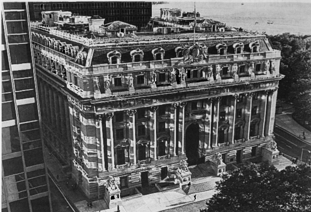
1. George Gustav Heye Center for the National Museum of the American Indian, Smithsonian Institution.

been developed as a parasite; the Customs House its host. With no exterior markers other than signage, the museum gains civic significance from the landmark's status. But in return the center . . . cedes any possibility of contesting the values for which the Customs House stands" (Urbach 1994:88). The museum is wholly contained by the architectural space; a photographic banner at the foot of Broadway is the only indication of its presence inside. Susan Power, a Dakota Sioux writing in Bazaar magazine, has interpreted the arrangement quite differently. "For many Native Americans a circle symbolizes the universe, so the museum's exhibits end where they begin. To view the exhibits is to circumnavigate the globe or dance around a drum" (1995:112).