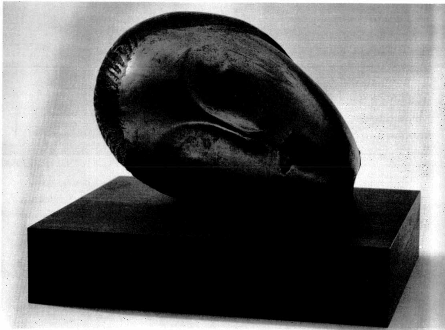
Sleeping Muse . Constantin Brancusi. Bronze. H. 6 \frac{3}{4} , L. 9 \frac{1}{2} in. The Metropolitan Museum of Art. The Alfred Stieglitz Collection, 1949. (49.70.225).

its present state it could not have been a significant or useful object in Abomey, and would almost certainly not have been displayed. How must we display it? The curatorial impulse is to mount it upright on a block, but since it has become meaningless in terms of its original culture, and has now become an artifact of our culture, could we validly show it simply lying on its side? That would give it a certain resonance with works of Western art (notably Brancusi's "Sleeping Muse") and would be a statement about the place this African head occupies in our inventory of cultural objects.