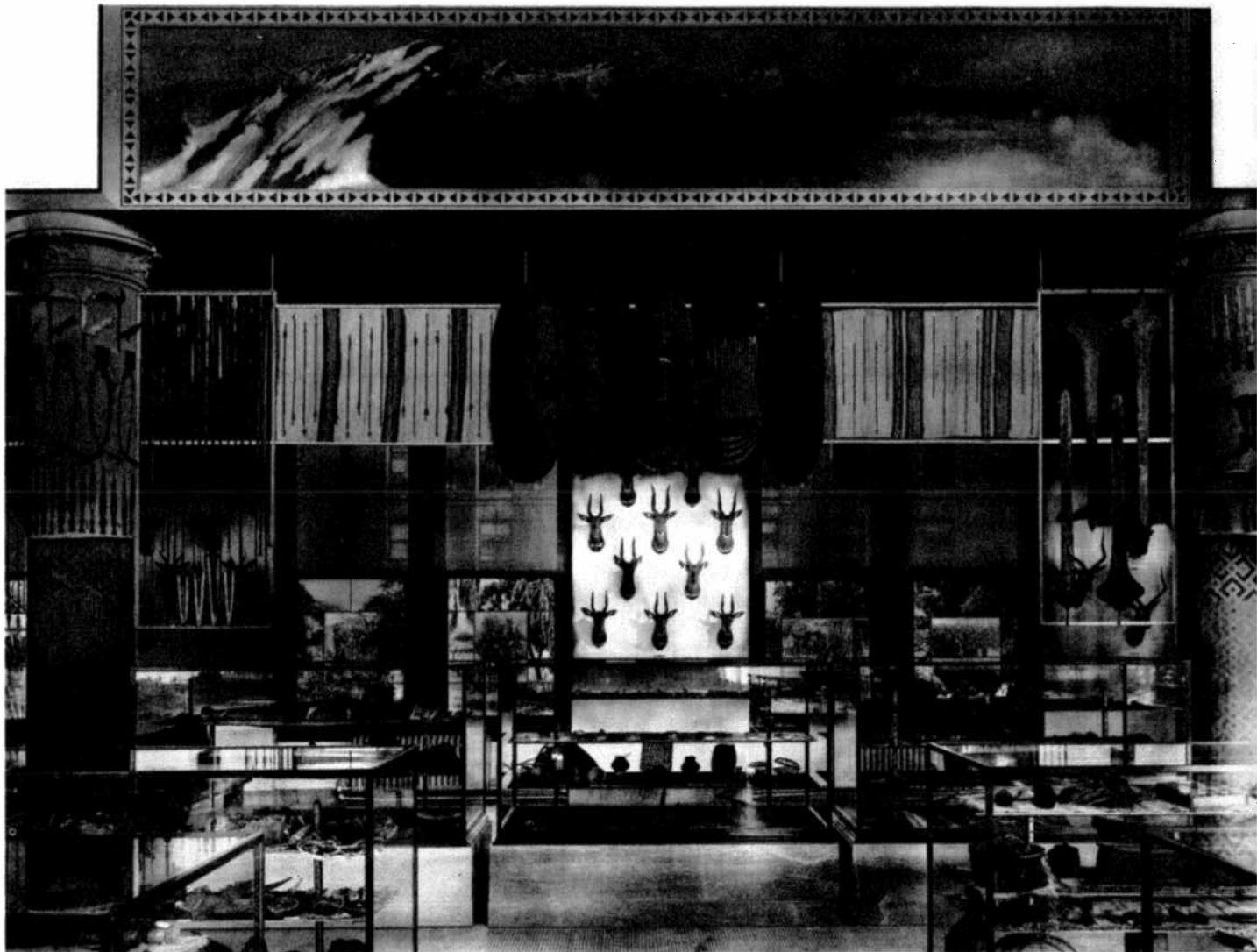
The 1910 African Hall at the American Museum of Natural History combined ethnography and zoology, and was organized geographically. Note the novel use of color transparencies placed in window boxes, to give the viewer a sense of context. Negative Number 32926.

tion makes assertions about African material culture. The museum exhibition is not a transparent lens through which to view art, however neutral the presentation may seem.