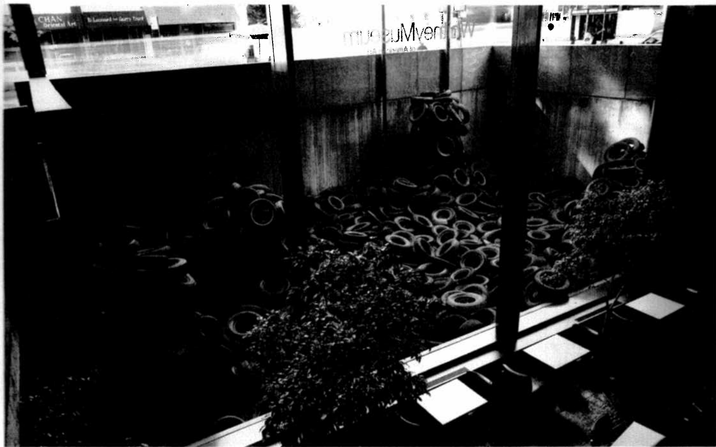
Installation view of Alan Kaprow's Yard (1961) reconstructed in 1984 for the Whitney Museum of American Art's exhibition Blam! The Explosion of Pop, Minimalism and Performance 1958-1964 .