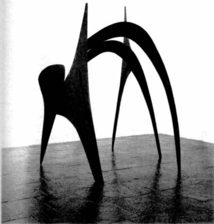
The Arches , 1959. Alexander Calder. Painted steel. 106 x 107 1/2 x 87 in. Collection of Whitney Museum of American Art, New York City. Gift of Howard and Jean Lipman 82.44.

When at the end of the nineteenth century African art came to the attention of the West, it was mounted—both in the art world and in ethnological circles—the way Greek, Roman, Chinese, and other antiquities were displayed at the time: that is, figures set off by square or rectangular pedestals; masks and heads on necklike blocks; some masks hung on the wall like relief sculptures. (Masks, of course, are not relief sculptures; they are the front of a composition that included the wearer's whole head—a realization that complicates rather than elucidates the display problem for a museum.) Recognizing that the methods we adopt to display African sculptures are arbitrary and remote from the ways in which they were meant to be seen forces us to reexamine our displays.