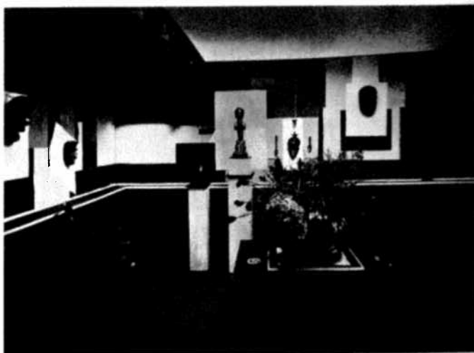
Installation view of Steiglitz' 291 Gallery, New York City, 1914-1915

The crowded presentation of the old fashioned natural history museum grew out of a desire to show many typical examples, but it also reflected the generally cluttered aesthetic of the period. It is interesting, however, to note that one of the earliest exhibitions of African sculpture in an art gallery presented it much as art museums do today—isolated for aesthetic contemplation, completely removed from its cultural context or any suggestion of use.