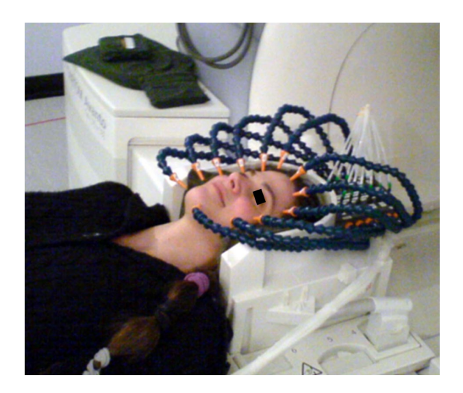
Fig. 1 The experimental apparatus

Uni university level, Sec secondary school level, Y yes, N no, L/D light/darkness sensitivity Aetiology abbreviations: RoP retinopathy of prematurity, Ret pigm retinitis pigmentosa