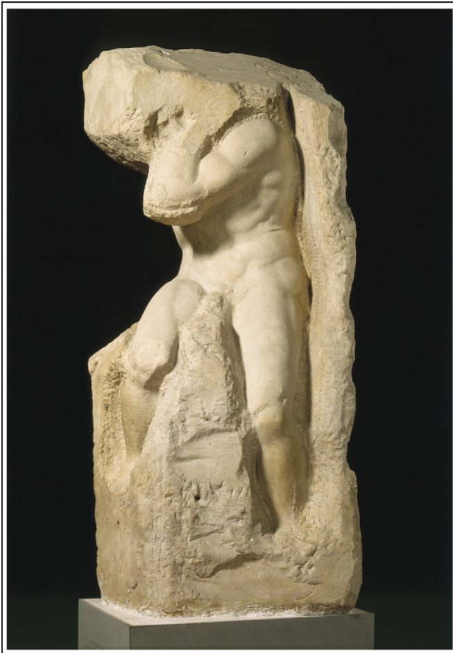
Figure 1. Embodied simulation in esthetic experience: actions. The sense of exertion, which Michelangelo intended his figures to show as they struggle to escape from the block of stone, is effectively conveyed to the spectator. Michelangelo, Slave called Atlas , Florence, Academia (ca. 1520–1523), marble © Scala/Art Resource, NY.

During the second half of the 19th century, several German scholars writing on the visual arts set out their views on the felt bodily engagement of the spectator in her or his responses to paintings, sculpture and architecture [11,12] (Box 2). In the work of Maurice Merleau-Ponty [13], much attention was paid to the esthetic consequences