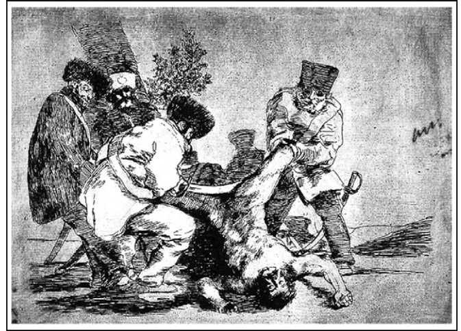
Figure 2. Embodied simulation in esthetic experience: empathy for pain. The viewing of images of punctured or damaged body parts activates part of the same network of brain centers that are normally activated by our own sensation of pain, accounting for the feeling of physical sensation and corresponding shock upon observation of pressure or damage to the skin and limbs of others. Goya, Que hay que hacer mas? ( What more is there to do? ), plate 33 from Los Desastres de la Guerra ( Disasters of War ), etching, Bibliothèque Nationale, Paris, France © Bridgeman-Giraudon/Art Resource, NY.

of the sense of physical involvement that paintings or sculptures arouse. He also suggested the possibilities of felt bodily imitation of the implied actions of the artist, as in the case of the paintings of Cézanne. David Rosand has devoted attention to the sense of empathetic engagement with the actions of implied hand movements in drawings by artists from Leonardo through to Tiepolo and Piranesi [14]. Although these theories were often respected, the phenomenological position has not found much traction in the field of art history.