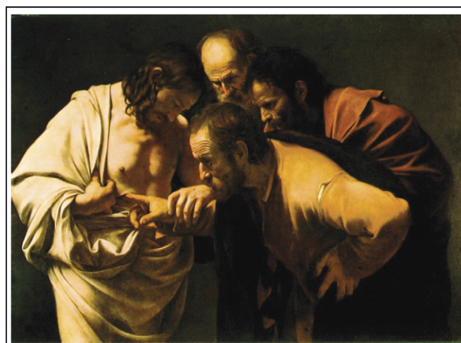
Figure 5. Embodied simulation in esthetic experience: empathy for tactile sensations. Vision of another person being touched automatically activates the cortical network of areas that are normally involved in the experience of being touched, as is clear from our experience of viewing paintings such as Caravaggio's Incredulity of St Thomas (1601–1602), oil on canvas, Potsdam, Sanssouci, © Stiftung Preußische Schlösser und Gärten Berlin-Brandenburg.

Whether in response to a wide range of non-figurative works or to figurative works where the marks of the maker's instruments are particularly clear, observers often