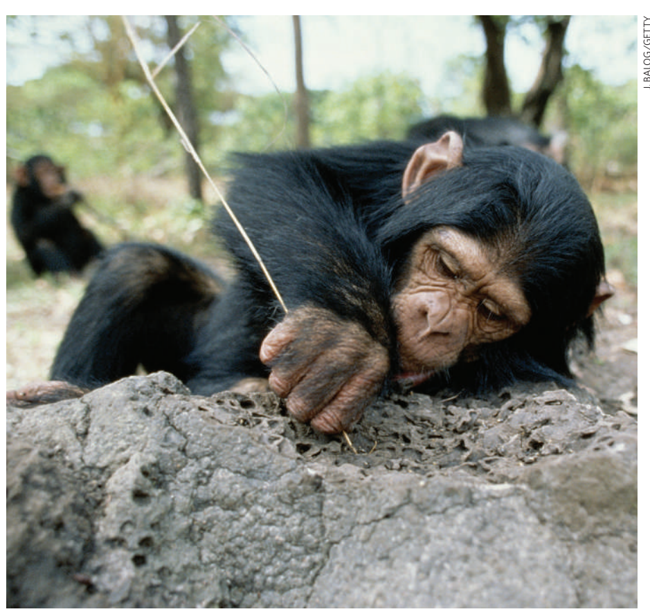
Fast learner: tool use is one of the traits that sets the great apes apart from most other research animals.

In some cases, therapeutic medical care could be extended to include data collection