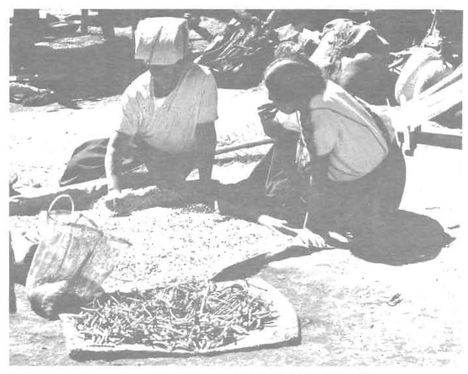
Zinacanteco women sort beans in their house yard

Gossip, like espionage, is assymetric: gathering in more than it bestows. Moreover, gossips are not locked in a social system whose rules they can only, pettily, enforce. Instead they create social rules by invoking them—in outraged tones, to be sure—in gossip. And if privacy feeds on competition between social units, gossip that invades that privacy may be expected to be a weapon of competition. Household gossips against household for advantage; brother slanders brother for land; and so on. But since few people manage all the information they want to manage, since gossip often backfires or goes too far, Zinacantecos, like many of us, enjoy but worry about gossip.