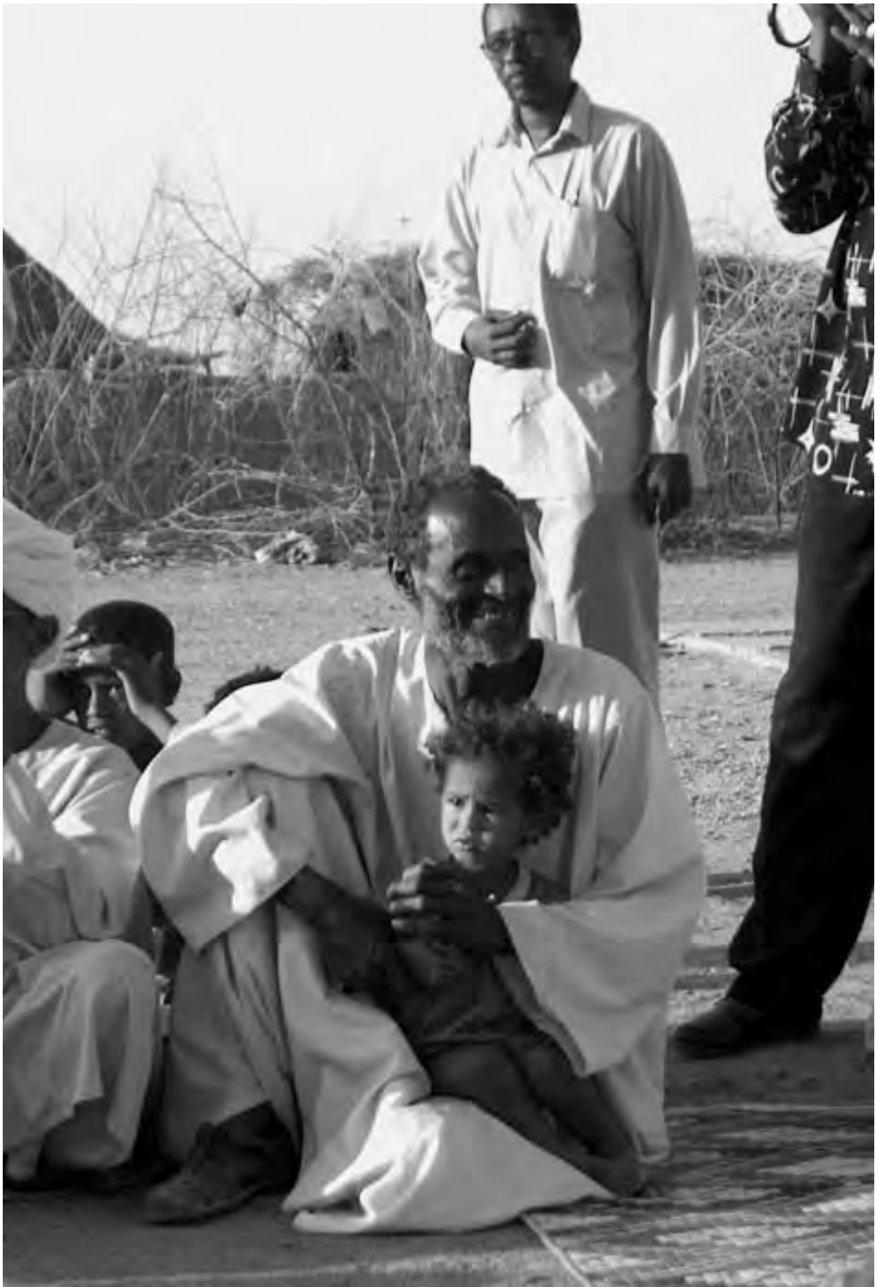
A man from the Beni Amir ethnic group for eastern Sudan holds his daughter while attending a workshop on FGM, Idimair, Kassala State.