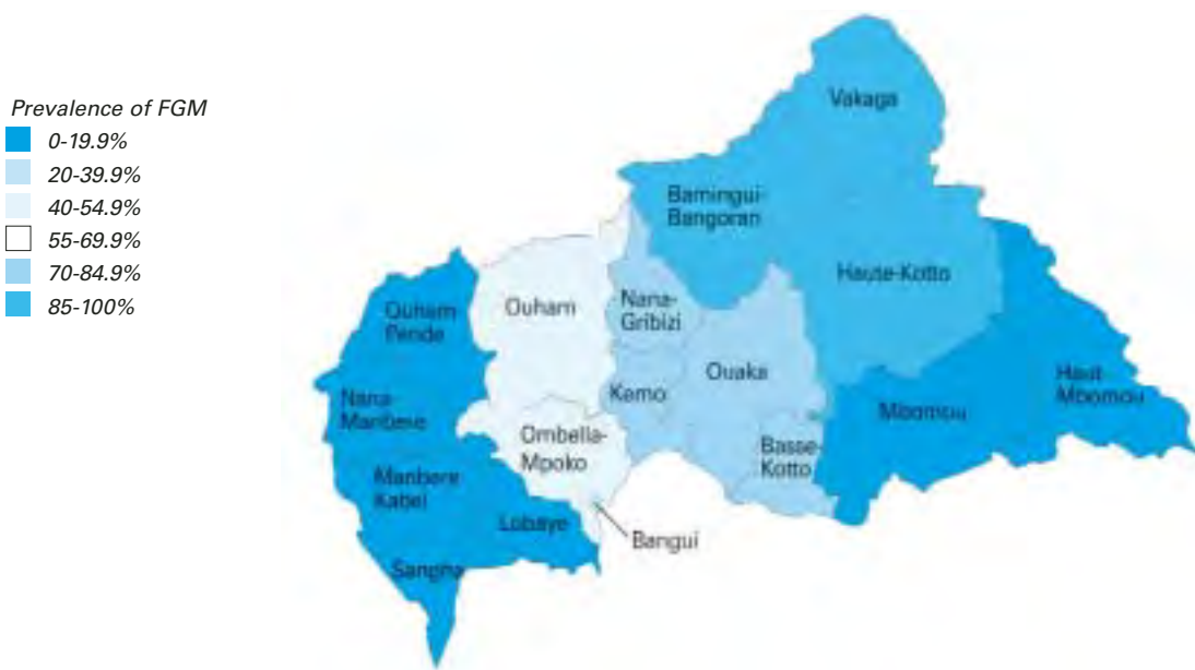
Map 2 - Central African Republic, 2000

The value of disaggregation by region or province is illustrated by the case of the Central African Republic (map 2), where data from MICS2 indicate that, at the national level, 36 per cent of women aged 15 to 49 have undergone FGM/C. Looking at the situation from a sub-national perspective reveals significant geographic variations. In five prefectures in the west of the country and two in the east, FGM/C prevalence