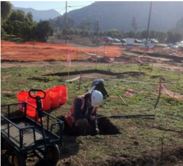
Archaeologist examines excavation pit on Horse Ranch Creek Rd. construction site.

In 2006, Pardee Homes commissioned the archaeological dig that would ultimately become part of the original environmental impact report. As a result of that study by archaeologists from ASM Affiliates , what was originally thought to be the Tom-Kav village boundary was expanded to include some new discoveries.