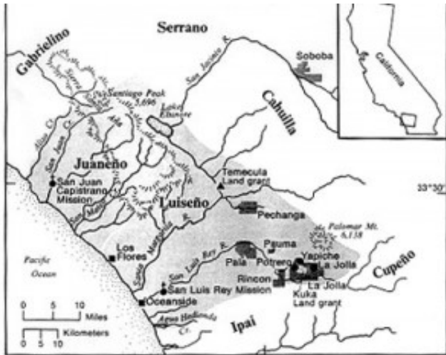
Map of Luiseno Territory, from savetomkav.wordpress.com

San Diego County is home to more Indian reservations than any other county in the United States , with several of them within a 20 mile radius of where the planned North Education Center would be located, including the Pala, Pauma, Rincon, and Pechanga reservations. So it should come as little surprise that according to those very environmental impact reports filed with the County of San Diego, studies found a significant amount of Indian cultural artifacts and resources on the property.