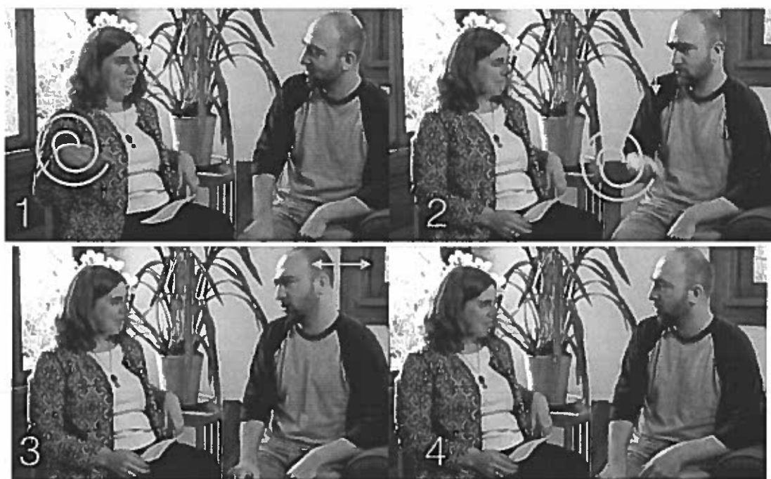
Figure 1: Stills from Mirrors .

Transcript 1: Mirrors (White's narrative)