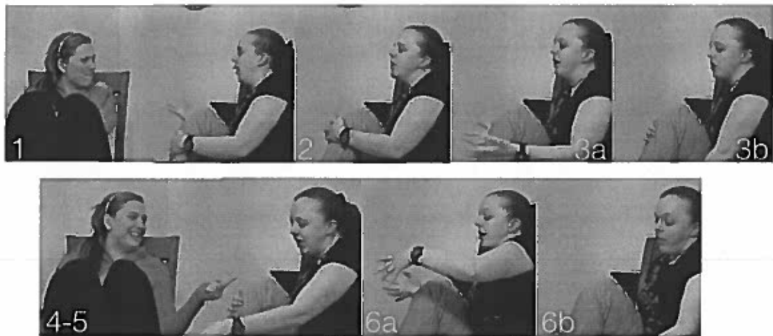
Figure 3: Stills from Halloween .

An example of a QD is given in Transcript 3 and Figure 3, which is taken from a narrative about Black's failed attempts to find a suitable Halloween costume as a small child. Black is on the right of the frame and her addressee, Pink, is on the left. The QD is italicized on lines 2 and 3 of the transcript: in line 2, Black voices her past self, and in line 3, she voices her mother's response.