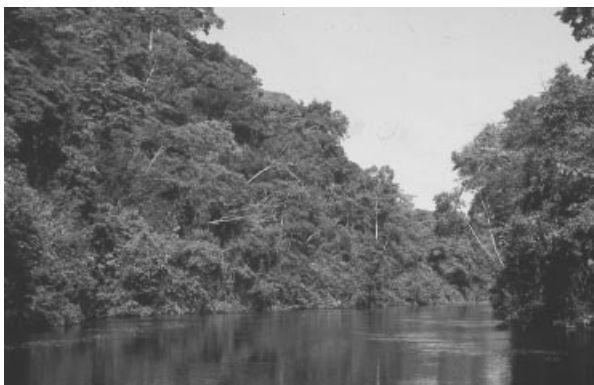
Plate 1 Vegetation along the Yenge River.