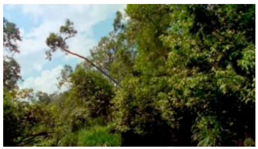
? Motivation to copy? Do human children really rely on mom longer?