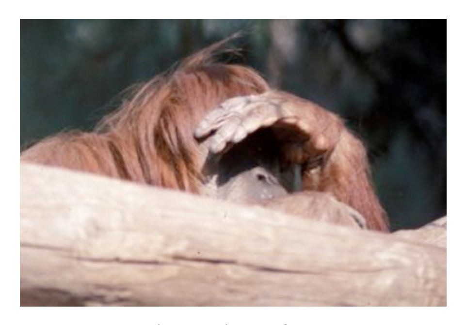
What's happening here?

All we need to do is slow the rate of loss, because the current global path cannot continue; we're going to fix it or self-destruct. Conservation will give us something to fix, or leave something to recover after we fall apart.