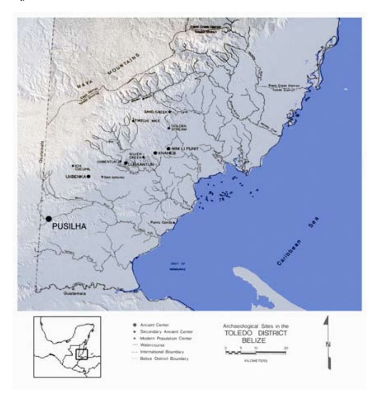
Figure 1. Southern Belize region, showing the location of Pusilhá (Volta 2007:Figure 1).