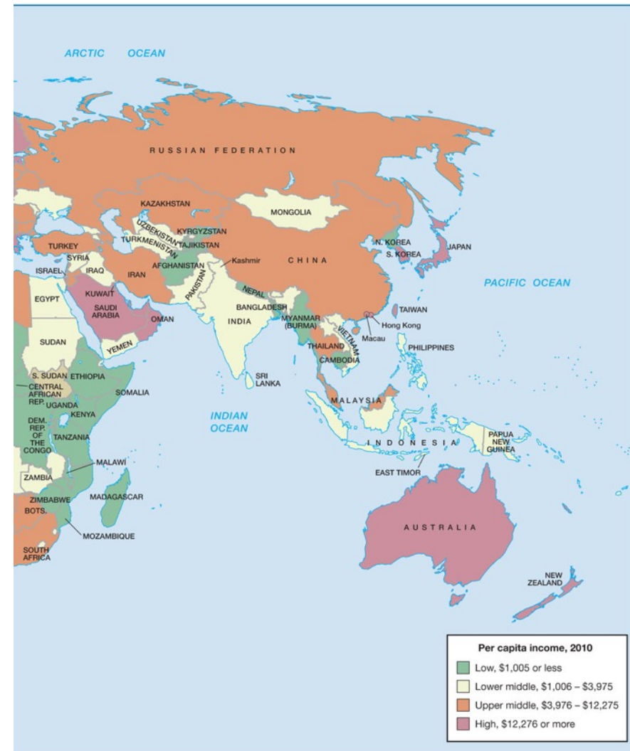
Map 10.1: Income Around the World