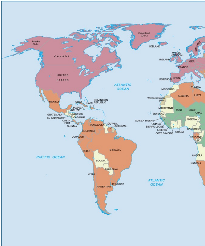
Map 10.1: Income Around the World