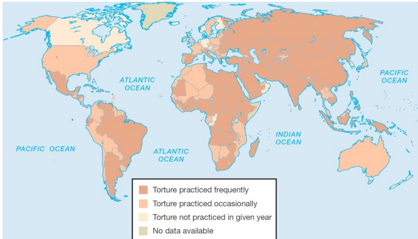
Map 12.2: Torture, 2009