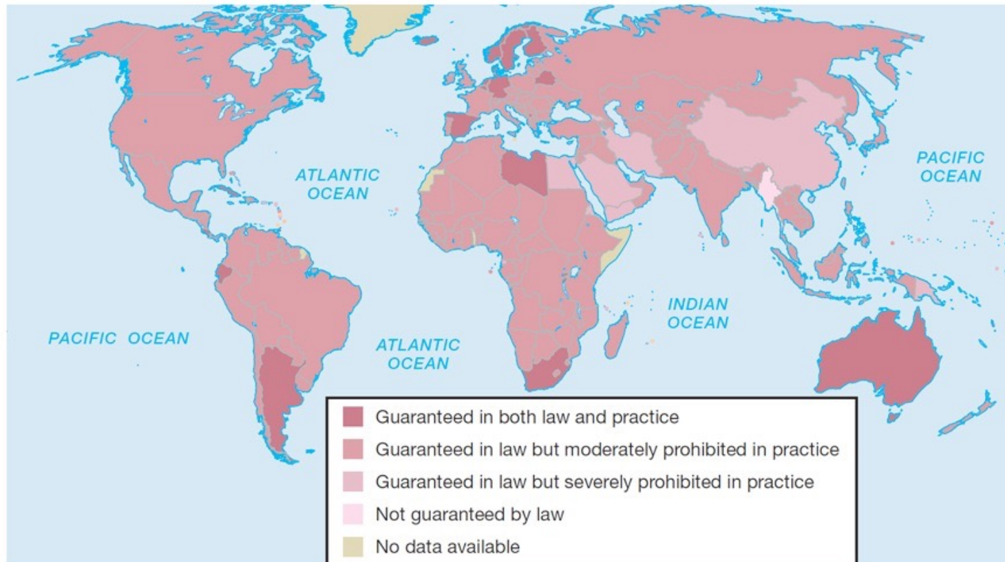
Map 12.3: Women's Political Rights, 2009