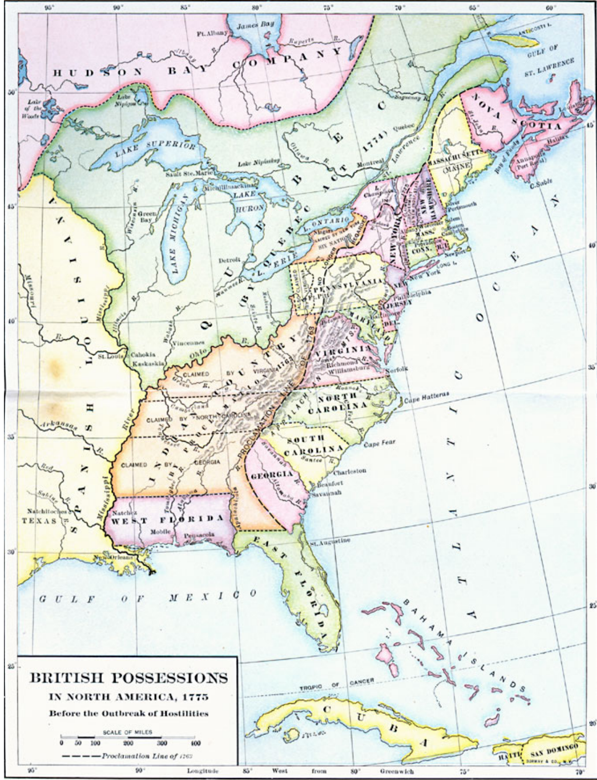
BRITISH POSSESSIONS IN NORTH AMERICA, 1775 Before the Outbreak of Hostilities

SCALE OF MILES 0 50 100 200 300 400 --- Proclamation Line of 1763